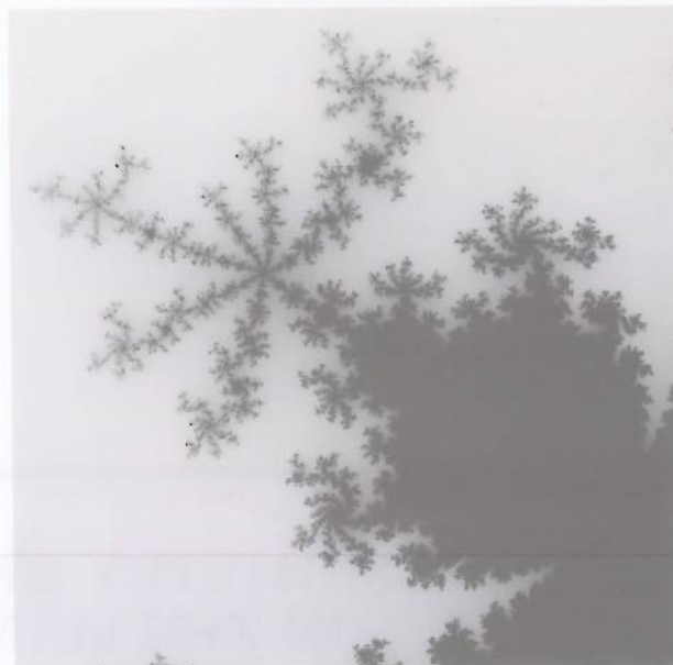
Fig. 3 The 3/7 bulb.