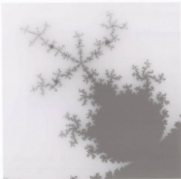
Fig. 2 The 2/5 bulb.

from the principal spoke in the counter-clockwise direction. Also, the “longest” spoke is located exactly p/q turns from the principal spoke in the clockwise direction. While this fact is not always true, nevertheless an “expert” in complex dynamics can usually judge where the shortest and longest spokes should lie and thereby read off p/q .